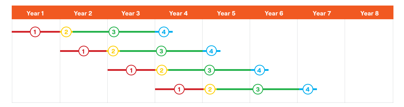
Chart of individual steps of the long-term performance bonus